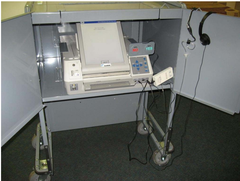
Figure 1. ES&S AutoMARK Ballot Marking Device (BMD)

During the Fall 2008 and 2009 Primary and General elections, all registered voters in the City of New York, including voters with disabilities, will have another way to cast a ballot in addition to using a lever machine or submitting an absentee ballot. Voters will be able to vote using a B allot M arking D evice (BMD). The Board of Elections in the City of New York (BOE) will install at least one (1) BMD in each poll site. The BMD does not count votes ; instead, it simply marks the voter's selections on a paper ballot. The voter then deposits the completed ballot in the ballot box to be counted by hand at the close of the election.